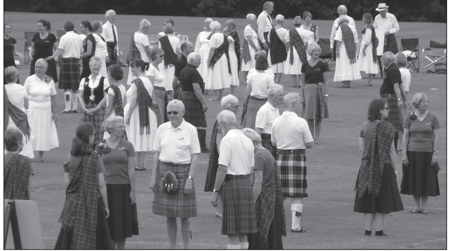
"We are ready to start" at this years White Rose Festival